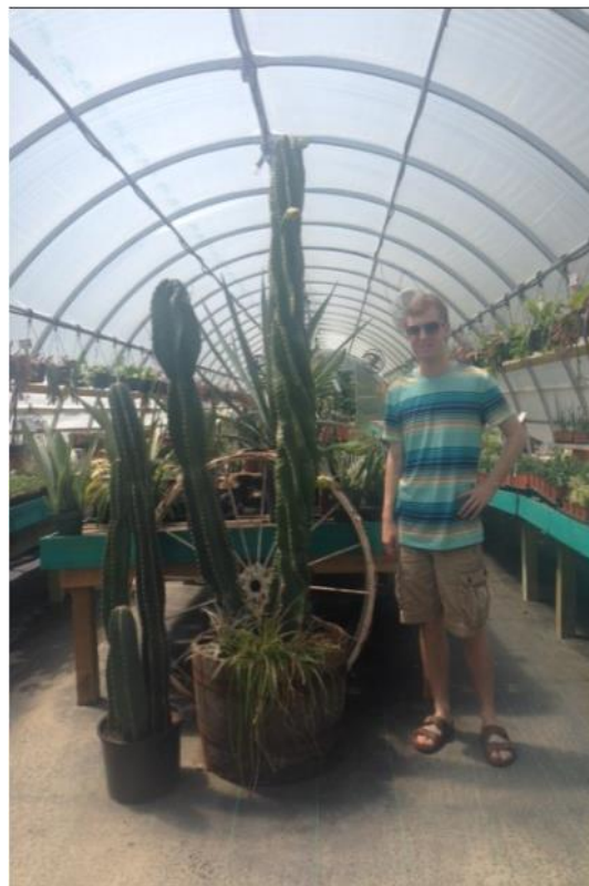
Above: Greenhouse with Specialty Plants (Unopen to the Public)