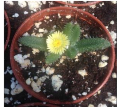
Above: Specialty Plant Examples (Not for Sale)